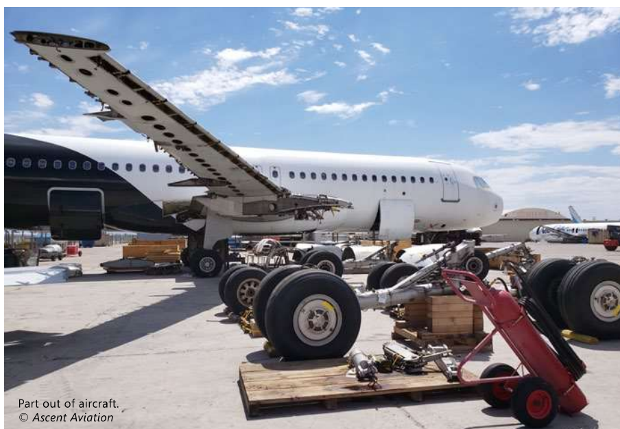
Part out of aircraft.